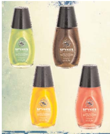
Spkyes, a new product by Anheuser Busch, could easily be looked over due to their small size--only 2.5 oz.

These new products appear to be marketed for young people. Also, as they begin to appear, officers may not realize that these bottles contain alcoholic beverages. They are the size and shape of many small perfume or mouth wash bottles. With the different colors of liquid they could be easily overlooked by patrol officers, especially in a woman's purse.