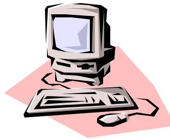
Prevention Information at your fingertips