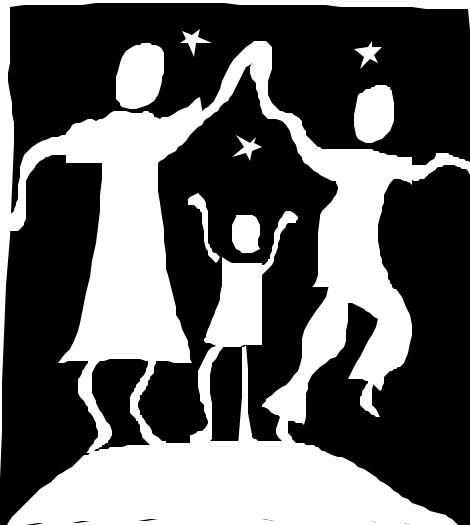
Sign up to receive the Campaign's Parenting Tips E-mail at www.TheAntiDrug.com

Information from the round-table is featured in the May issue of Good Housekeeping .